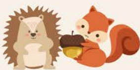
Year R Hedgehogs and Squirrels

Don't forget to check your child's year group page every Friday for news straight from the classroom. Click the pictures below for the relevant year groups: