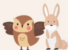
Year 1 Owls and Rabbits