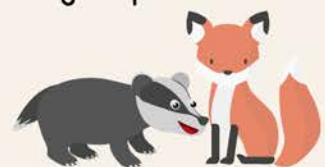
Year 2 Badgers and Foxes