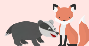
Year 2 Badgers and Foxes