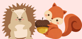
Year R Hedgehogs and Squirrels