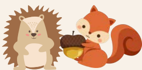
Year R Hedgehogs and Squirrels

Don't forget to check your child's year group page every Friday for news straight from the classroom. Click the pictures below for the relevant year groups: