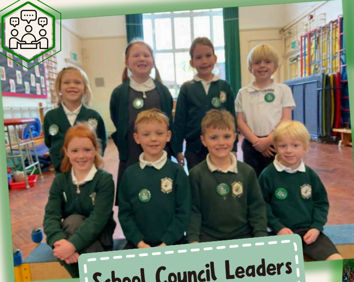
School Council Leaders