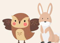
Year 1 Owls and Rabbits