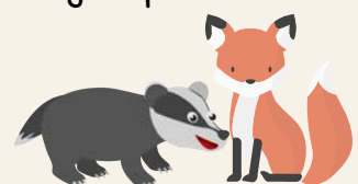
Year 2 Badgers and Foxes