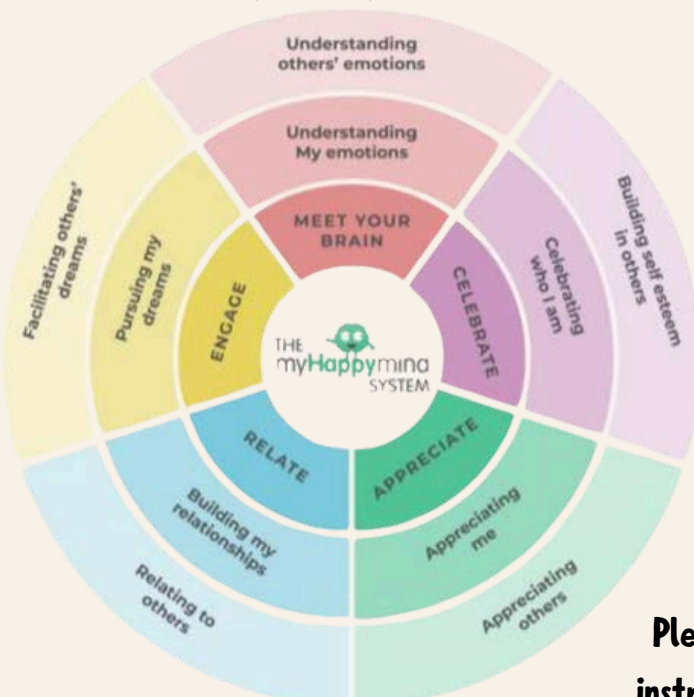
The myHappyMind modules

myHappyMind is an NHS-backed curriculum in primary schools, secondary schools, and nurseries and is focused on building resilience, self-esteem, and happiness in children. It is an award-winning programme that has received national recognition for its exceptional work in schools, nurseries, families, and organisations across the UK. Backed by NHS, it uses preventative strategies firmly rooted in science, research, and the fields of neuroscience and positive psychology.